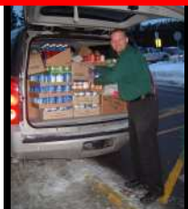
Volunteer from grocery store