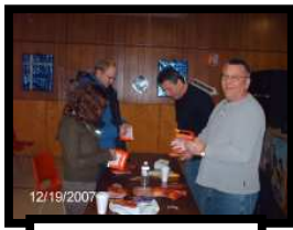
USW 1-2693 Volunteers