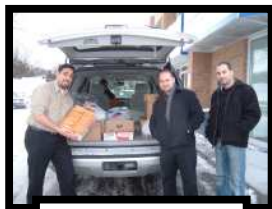
CEP 247 Volunteers