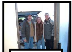
CEP 37x Volunteers