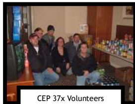
CEP 37x Volunteers