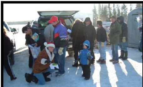
TIMMINS, ON - Members of CEP 37x and their children line up to pick up bags of food, toys and grocery gift cards donated in kind by organized labour

One union held a "Dinner for Two" raffle and entered a members name when they brought in a donation.