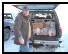
CEP 37x Volunteer