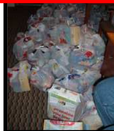
150 bags of food