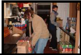
John McCrae High School Students