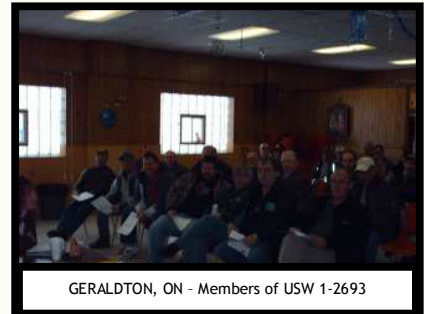
GERALDTON, ON - Members of USW 1-2693