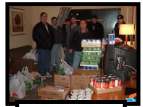
CEP 37x Volunteers

Dear Operation Christmas Cheer, Our Family is a recipient of your generous donations of food, toys, and grocery cards. It warms our hearts and we are very grateful for your labour of love in these difficult times. God bless you and your families. In Solidarity - Gauthier Family - CEP 37x Timmins