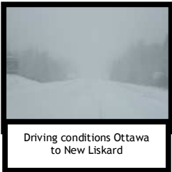
Driving conditions Ottawa to New Liskard