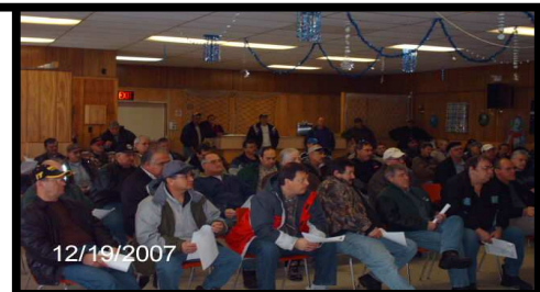
GERALDTON, ON - Members of USW 1-2693 who have been on strike for almost two years, gather at the Legion Hall to meet Operation Christmas Cheer.

Cheer was delivered in force to the picket-lines across the province and positive TV, newspaper, and radio media was generated in each community. There is no doubt that OCC supporters and volunteers made Christmas a lot brighter for many people and that spirits were uplifted. The strikers were remembered, encouraged, directly supported, and thanked for their steadfast courage against their immoral employers.