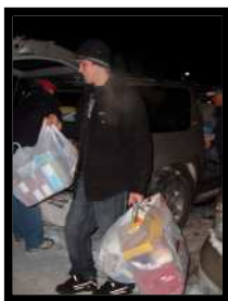
CEP 37x Volunteer